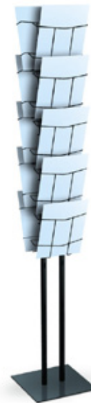
10 Basket Model Double-Sided