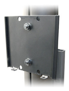
Bracket accepts screen with up to 200mm x 200mm VESA mount pattern (or 15 lbs.)