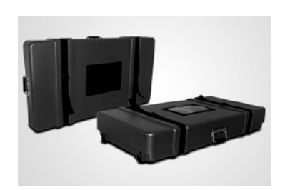
Expo Case 39 39"(w) x 19.25"(h) x 5.5"(d)

Just tilt and go, this shipping case is constructed from rugged thermoformed polyethylene and features strong steel, rubber gripped handles and heavy duty built-in wheels. Case includes an 8" x 12" label area and sturdy 1.5" wide straps with buckles.