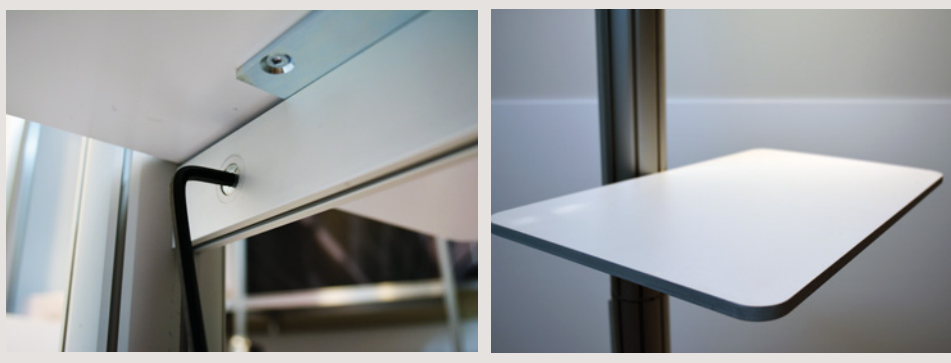
O4 Insert and fasten the Shelf to your desired height using the Hex Key provided. One half turn Right to lock it into place. Do not over turn as this will break the internal lock.