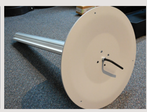
Attach the Bottom Post to the Base Plate. Use the screw from the Bottom Post to screw it into the baseplate using the large Hex Key provided.