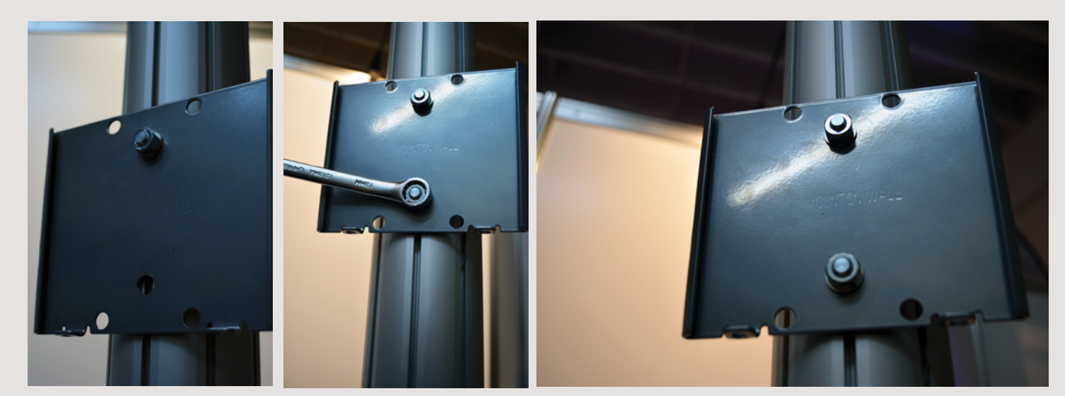
Use the provided Hammerhead Bolts to attach the Monitor Bracket at the desired height. Gently tighten the nuts using the provided wrech. Too much can warp the aluminum post or break the bolt. IMPORTANT: Ensure that a washer is used on both sides of the Monitor Bracket.