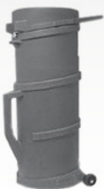
5' WHEELED CASE

1/4" thick anti-fatigue Comfort Floor provides the highest quality cushioned vinyl flooring for trade shows. See the chart below for popular kit configurations and shipping weights*.